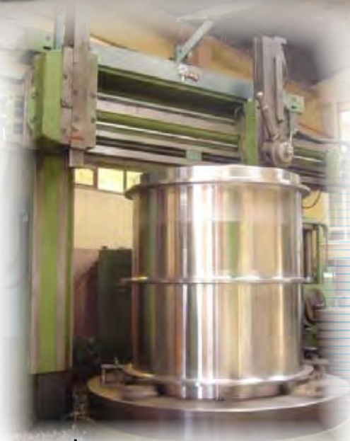
DİK TORNA Titan Ø: 3300 H: 2500