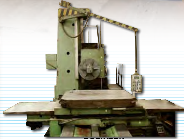
BORWERK 2500 x 2000 x 1800 mm