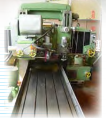
SATIŞ TAŞLAMA 4000 x 1000 x 500 mm