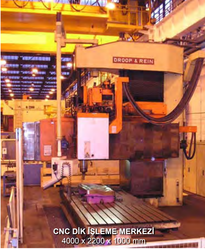
CNC DİK İŞLEME MERKEZİ 4000 x 2200 x 1000 mm