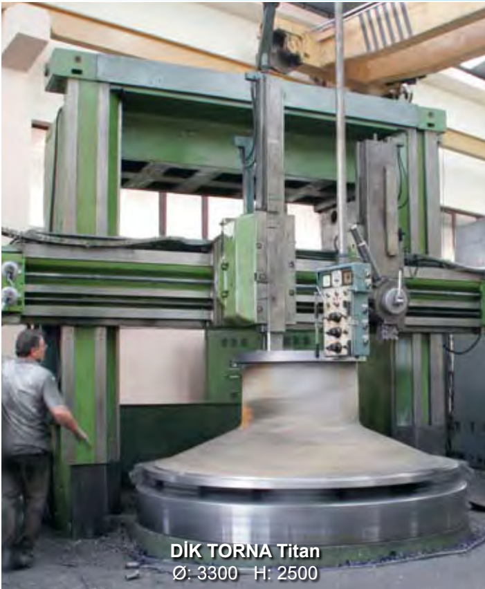
DİK TORNA Titan Ø: 3300 H: 2500