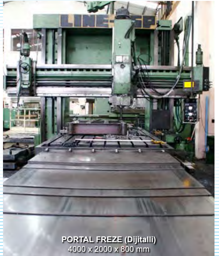
PORTAL FREZE (Dijitali) 4000 x 2000 x 800 mm