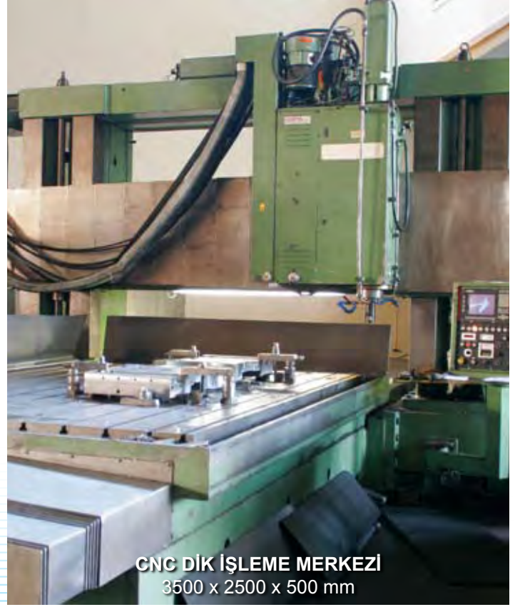
CNC DİK İŞLEME MERKEZİ 3500 x 2500 x 500 mm