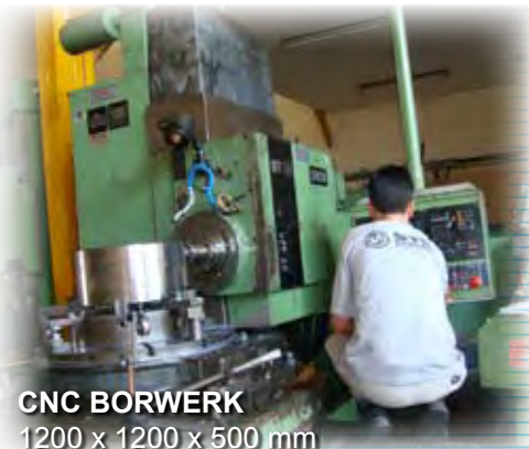
CNC BORWERK 1200 x 1200 x 500 mm