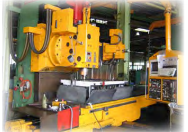
CNC DİK FREZE 3500 x 1000 x 1000 mm